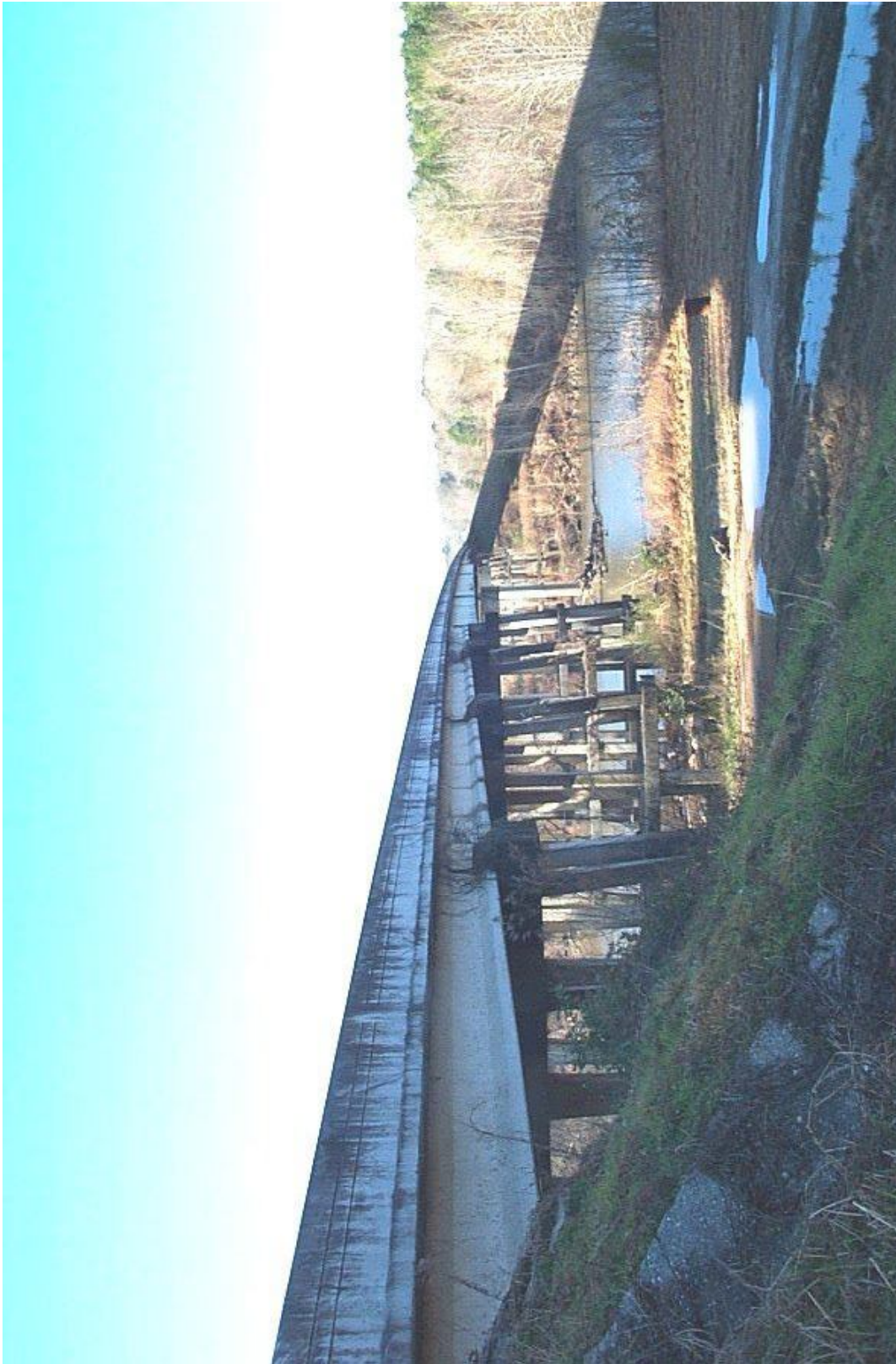
State Route 35