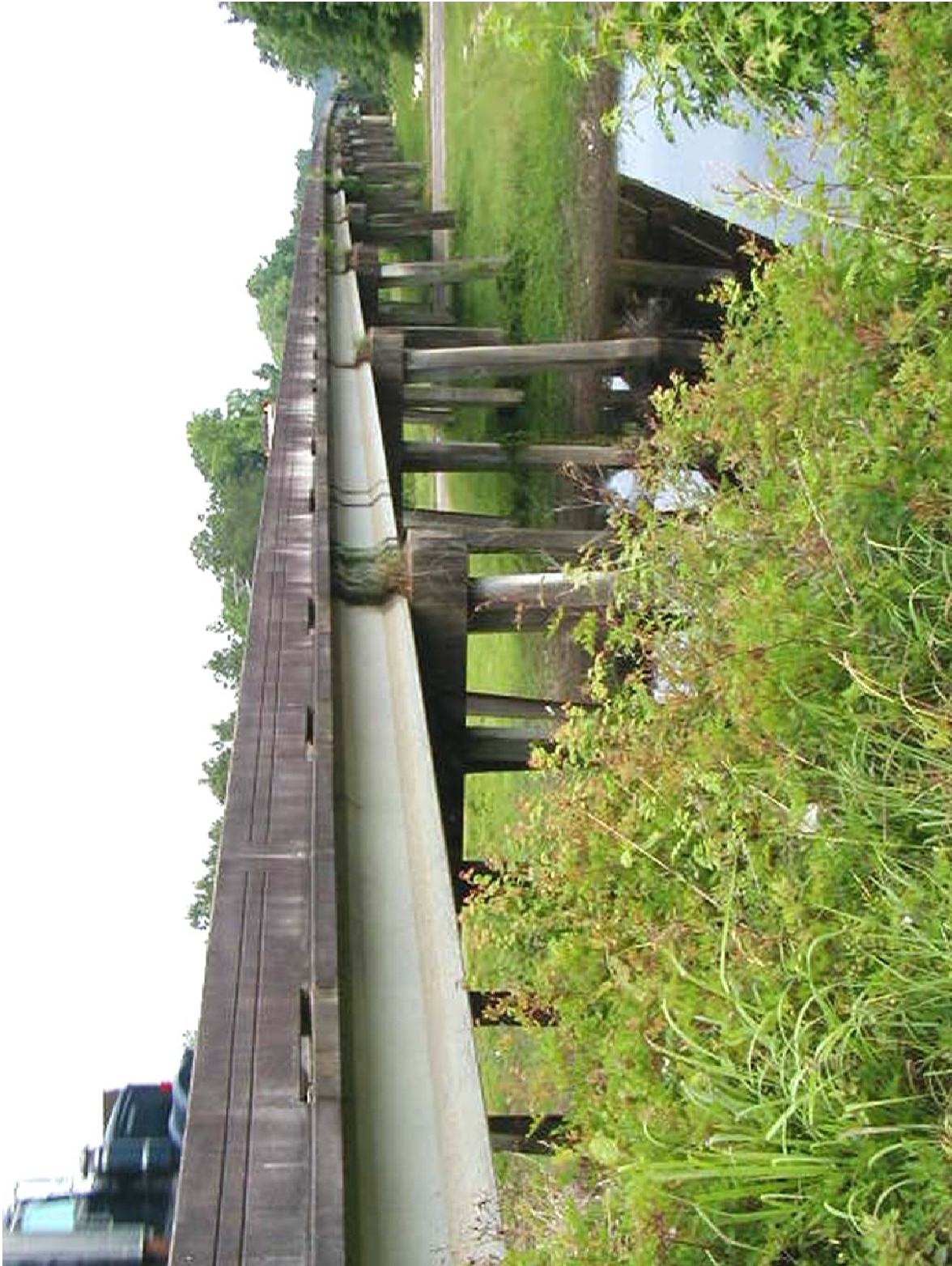
SR 29 at Leaf River