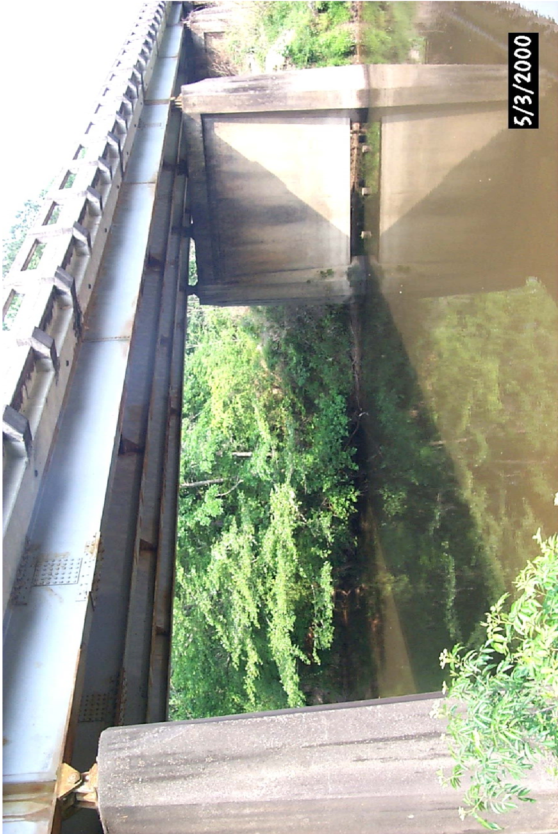
U.S. 49 at Black Creek