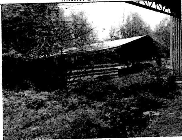
Open Barn View

SR16 Station No: 643+40-415 feet Rt. One (1) Pole barn